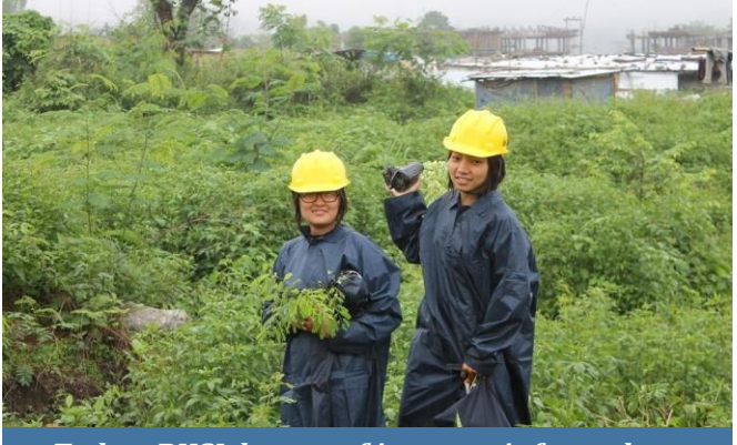
Today, BHSL boasts of its pursuit for a clean environment, health and safety (EHS) of its employees and stakeholders.