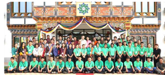
BHSL employees with Majesty the King and Her Majesty the Gyaltshen

A key adoption in the Hydropower Service Center is “Hydro manufacturing concept” (HMC) established by ALSTOM. HMC is based on the “Lean Concept” that streamlines process, improves efficiency, ensures high quality with low cost, reduces waste, and enhances health & safety of employees, that would ultimately enable to deliver fast, best quality, and affordable services to our customers. The successful implementation of 5S has also resulted in improvement of efficiency, productivity and creativity reflecting the commitment to excellence that defines BHSL.