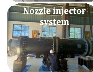
Nozzle injector system