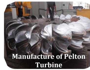
Manufacture of Pelton Turbine