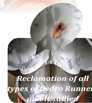
Reclamation of all types of hydro Runners and it's allied

We also take on the work of design, manufacture, and installation and testing of hydro-mechanical components including penstock ferrules.