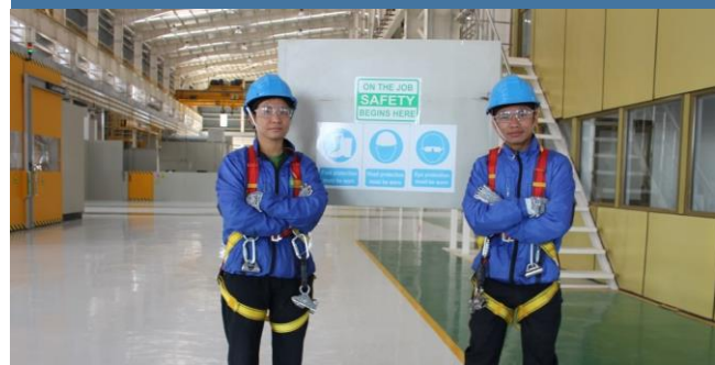
Target: Zero Man-days lost

Today, BHSL boasts of its pursuit for a clean environment, health and safety (EHS) of its employees and stakeholders.