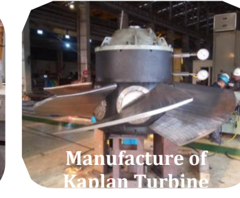
Manufacture of Kaplan Turbine

Our standardized and optimized process involves advanced welding & fabrication, CNC machining, assembly, hard coating, planning & industrial engineering and thus providing a one-stop facility to our valued customers.