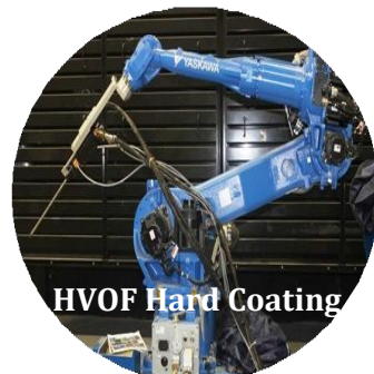
HVOF Hard Coating