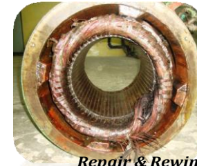
Repair & Rewinding of electric motors