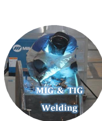
MIG & TIG Welding