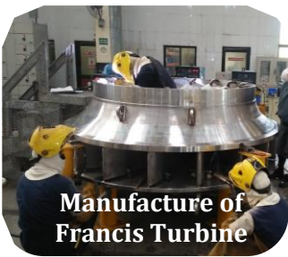
Manufacture of Francis Turbine